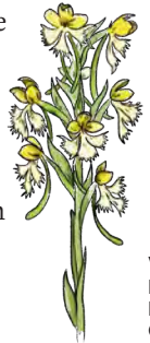
Western Prairie Fringed Orchid